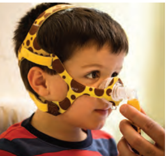
4. Connect the Wisp pediatric tubing and elbow swivel to the front of the mask.

Three cushion sizes (SCS, SCM, SCL) are available. Please read the Instructions for Use for additional fitting information.