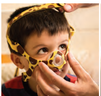
Pulling the headgear over the child's head, gently hold the cushion over the nose.